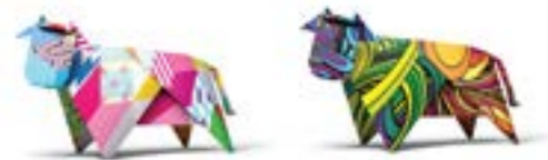
HP SmartStream Mosaic one-of-a-kind designs.